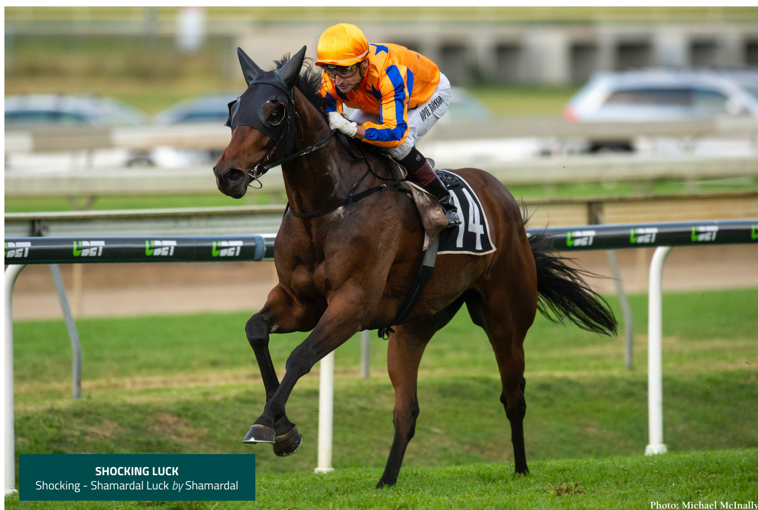
SHOCKING LUCK Shocking - Shamardal Luck by Shamardal