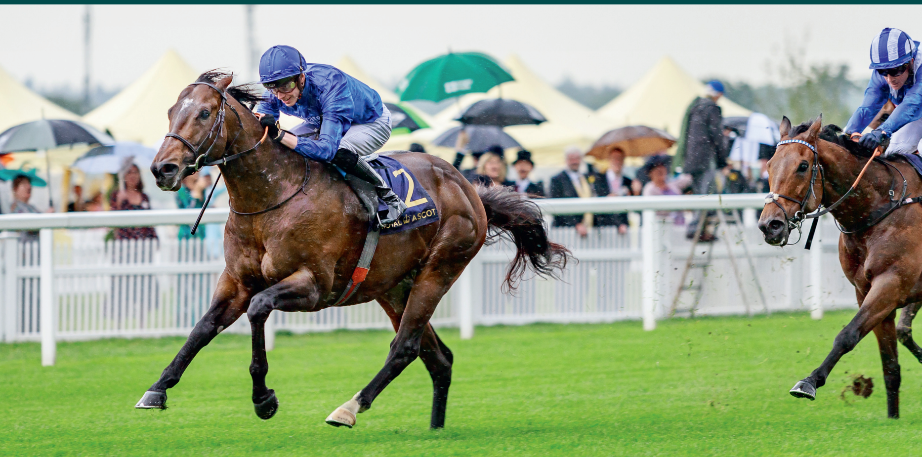
Above: Blue Point (IRE) (Shamardal - Scarlett Rose by Royal Applause); Right: Able Friend (Shamardal - Ponte Piccolo by Volksraad)

2008 at Dalham Hall). His immediate impact earned him leading first-season sire by progeny earnings during his first Northern Hemisphere season in 2009. Shamardal was also shuttled to Darley Australia from 2005 to 2010.