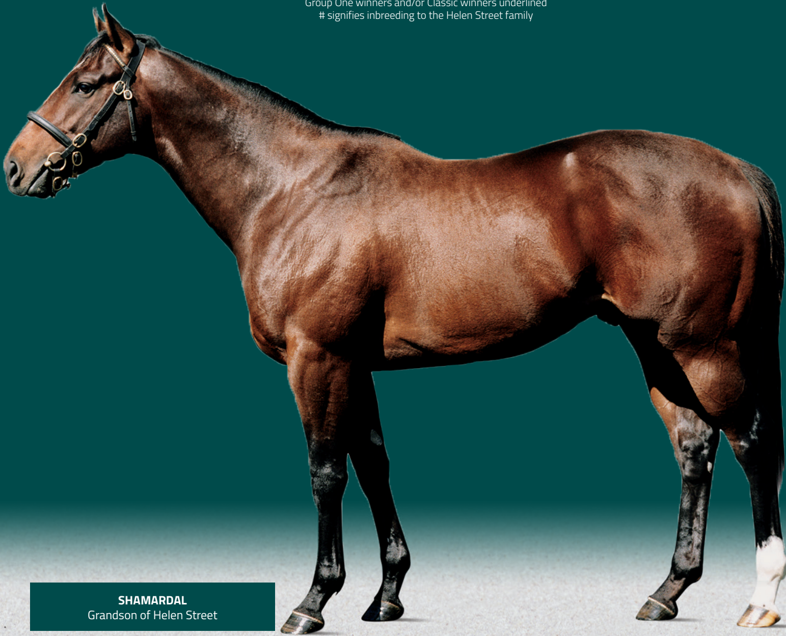
SHAMARDAL Grandson of Helen Street

Stallions in CAPITAL LETTERS Group Stakes Winners in bold Group One winners and/or Classic winners underlined # signifies inbreeding to the Helen Street family