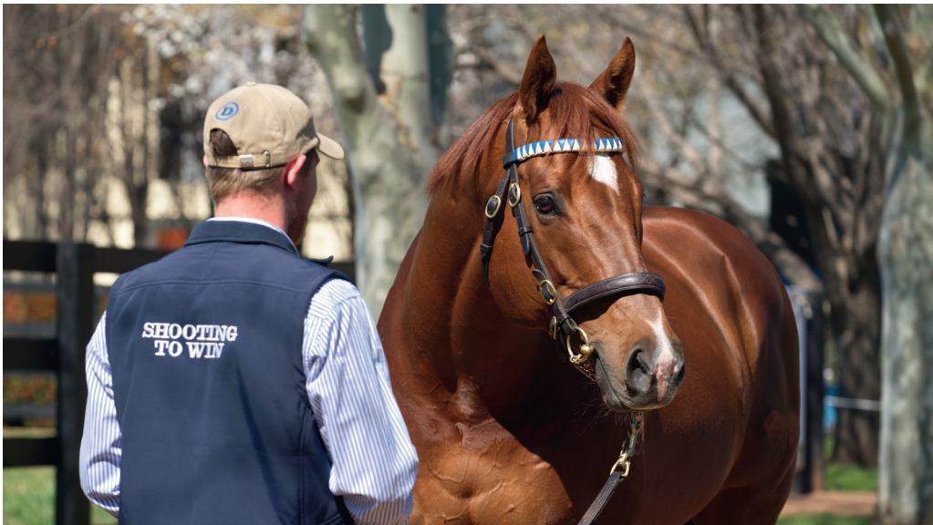
Shooting To Win (by Northern Meteor) is one of Eight Carat's descendant's carrying the RELIC blood into the next generation)