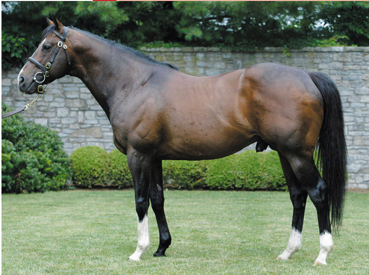
TALE OF THE CAT (USA)