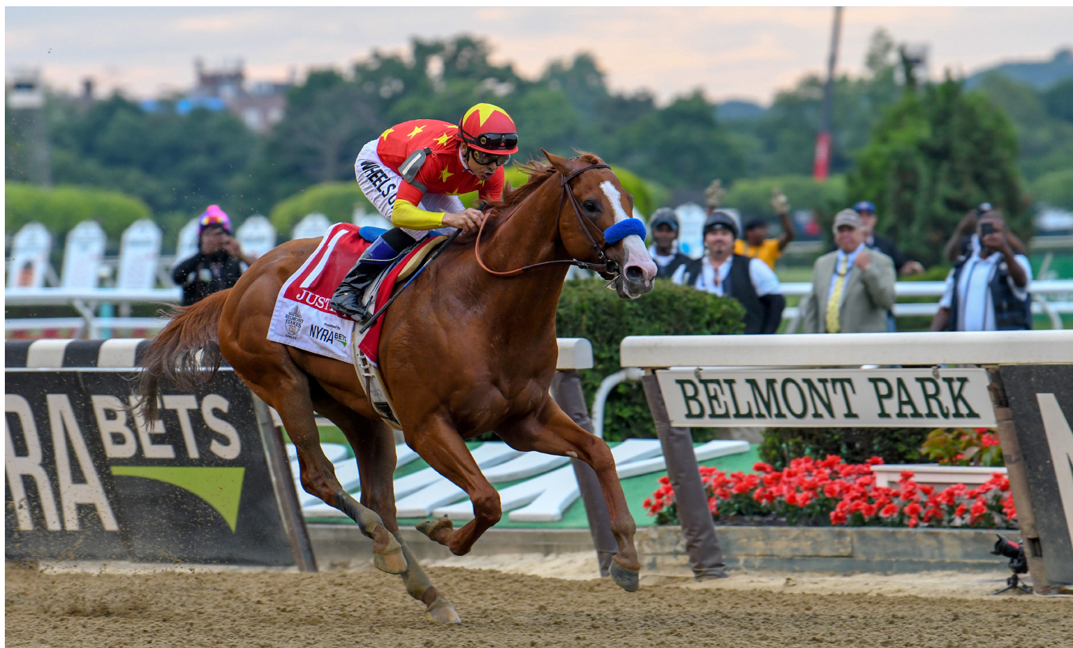
JUSTIFY (USA) (Scat Daddy-Stage Magic by Ghostzapper)

From eleven offspring, Narrate foaled only two fillies, Yarn and Preach, both of these full sisters by Mr. Prospector USA) would become key broodmares. Conversely, Narrate's nine male progeny were comparative under-achievers. Four of these went unraced while three others were gelded for a number of less than flattering reasons. By far, Narrate's best racehorse was her fourth foal, the Mr. Prospector filly Preach (see Narrate's family tree). Conditioned by Claiborne Farm's principal trainer Hall of Famer Shug McGaughey, Preach was best at two when she won the Frizette Stakes (US-G1) at Belmont Park after finishing third in Saratoga's Spinaway Stakes (US-G1).