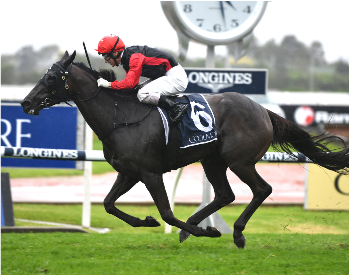
CON TE PARTIRO (Scat Daddy - Temple Street by Street Cry)