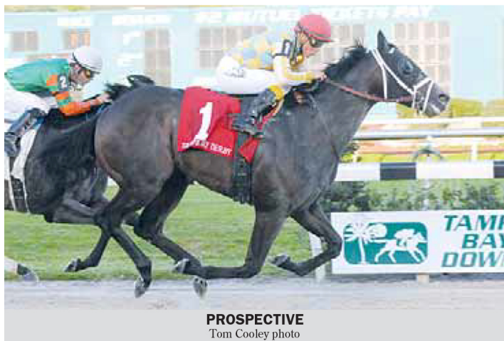
PROSPECTIVE