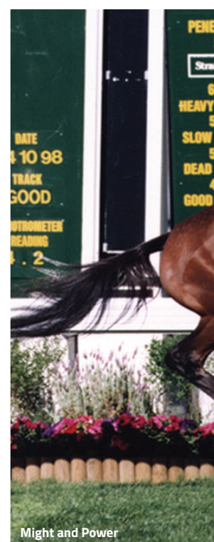
Might and Power