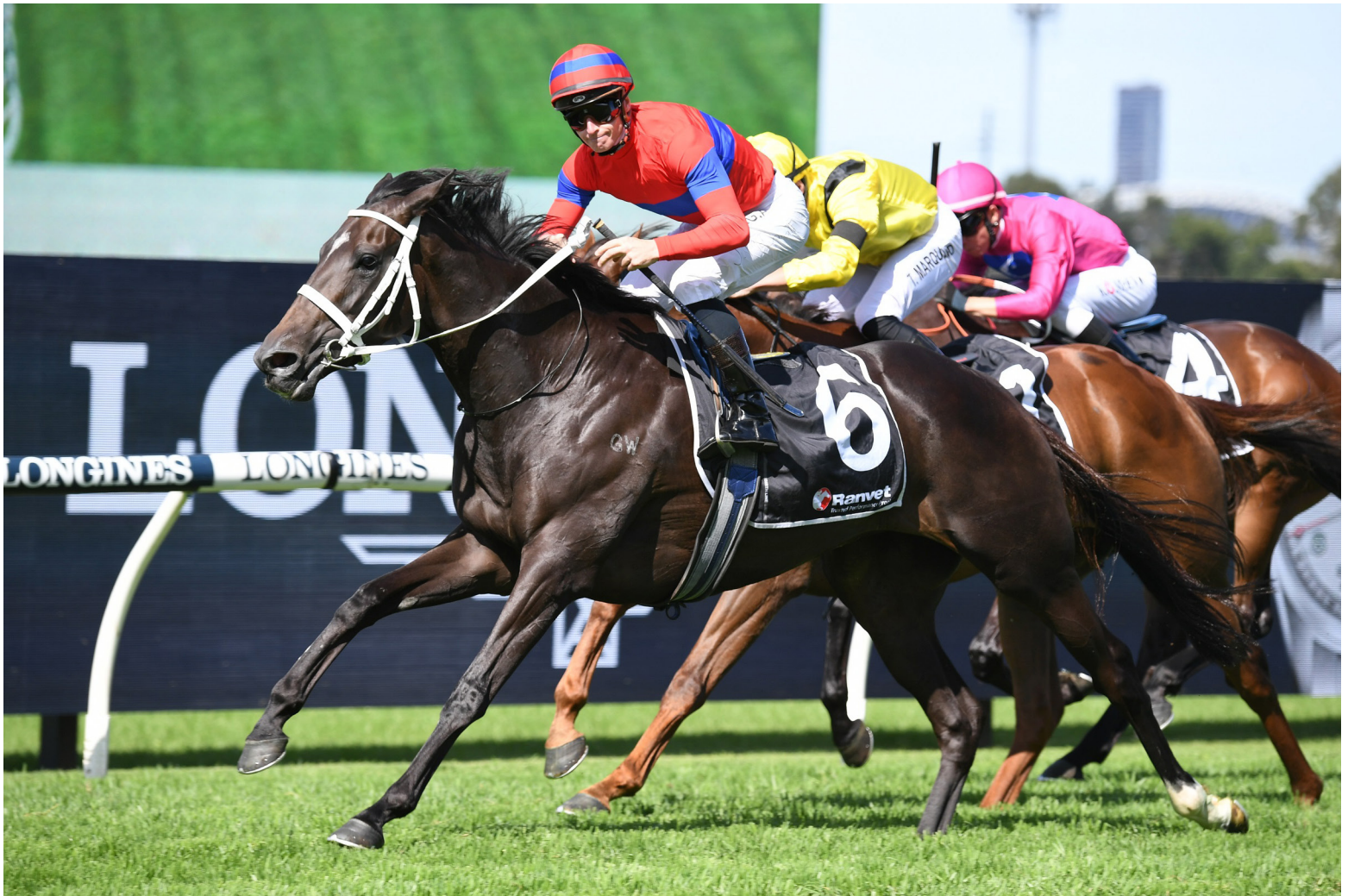
VERRY ELLEEGANT is a poster girl for the Rasmussen Factor. Her long priced win in the 2021 Melbourne Cup was part of an avalanche of wins in the world's biggest races at huge priors by runners with the RF.