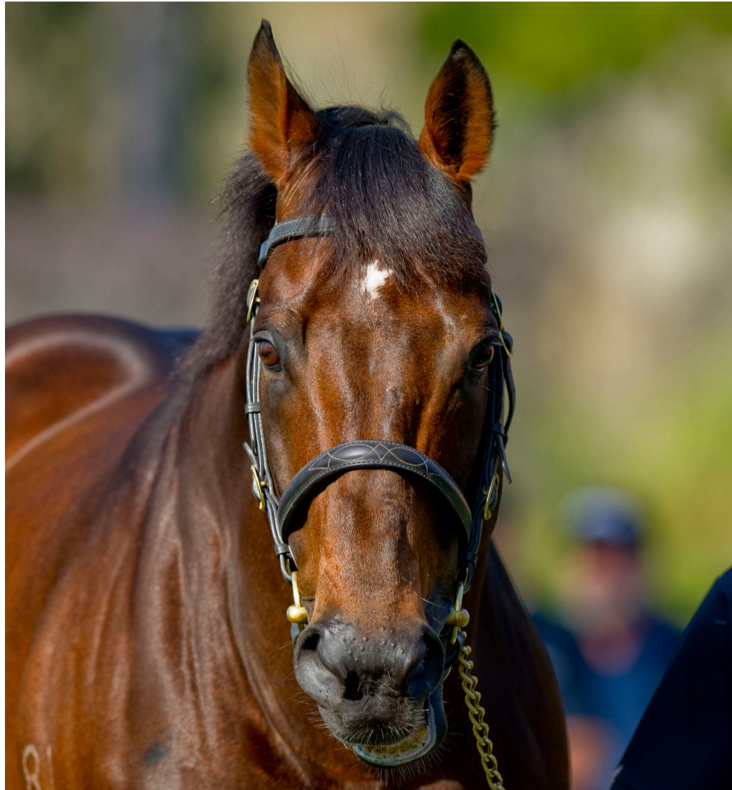
ENCOSTA DE LAGO

This current season, there are around fifty sophomore Rolls RFs but only roughly a dozen juveniles inbred to Rolls. This slowdown in the latter is probably related