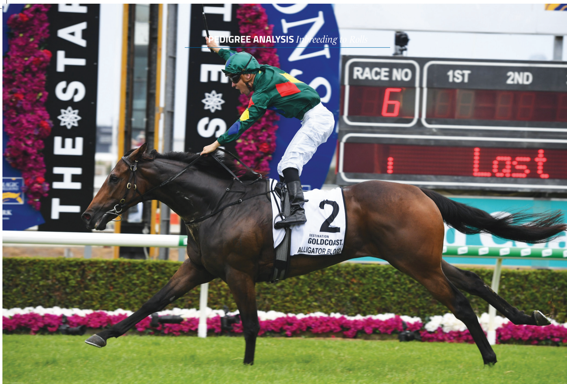
ALLIGATOR BLOOD who appears to have become the "poster boy for inbreeding to Rolls" enjoying a sensational 2022 with the capture of three Group One fixtures.