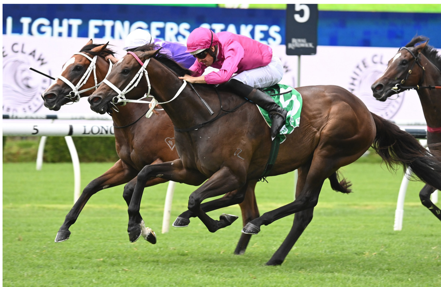
FANGIRL (Sebring - Little Surfer Girl by Encosta De Lago)

well as a game second to Champion three year-old colt and Godolphin juggernaut Anamoe in the George Main Stakes (GR1) at Randwick. Last time out in late October, in the world’s second richest turf race, the ten million dollar Golden Eagle Stakes run at 1500 meters, an unlucky Fangirl returned to top form when she came from near last